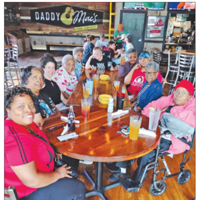
Participants gathered at Daddy Mac's for lunch to discuss the bus ride.

We also learned that most buses can accommodate two wheelchairs. However, we experienced firsthand how challenging it can be for wheelchair users due to street and sidewalk conditions. At one stop, the bus ramp couldn't be used because the stop was located on a narrow grassy strip. Broken sidewalks and uneven asphalt made pushing the wheelchair difficult and, at times, unsafe.