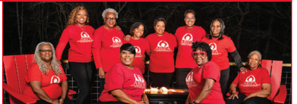
Celebrating 22 Years of Being the Community Health Connection for Asheville and Beyond