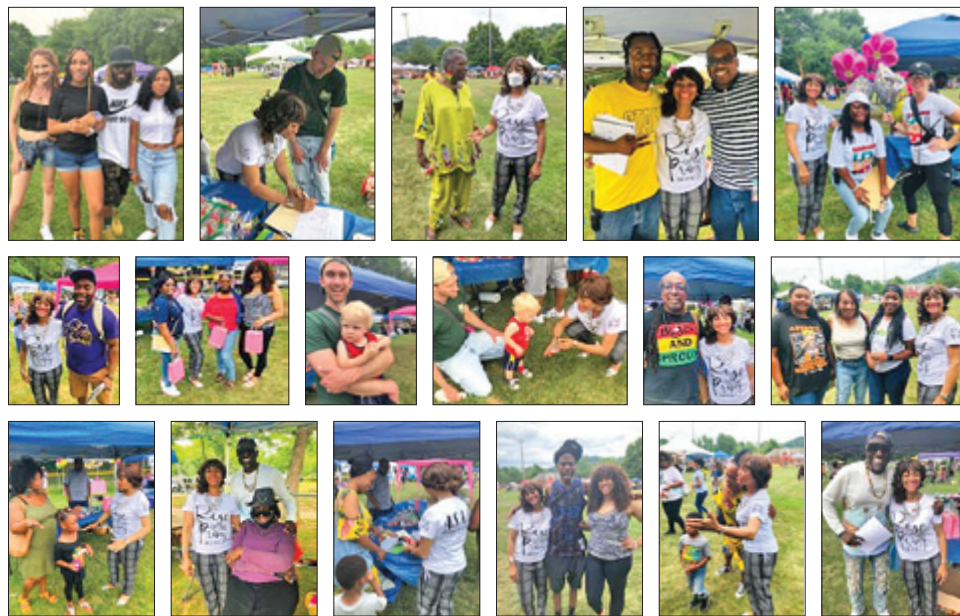
Below: Mount Zion Community Development, Inc.'s outreach & collaboration during the Juneteenth Festival. HOPE (Hope & Healing with Preventive Education) bags were distributed.

"We are gathered here in a house built by enslaved people. We are footsteps away from where President Abraham Lincoln signed the Emancipation Proclamation," she said at the White House signing ceremony. "We have come far, and we have far to go. But today is a day of celebration. It is not only a day of pride. It's also a day for us to reaffirm and rededicate ourselves to action." Source: NPR